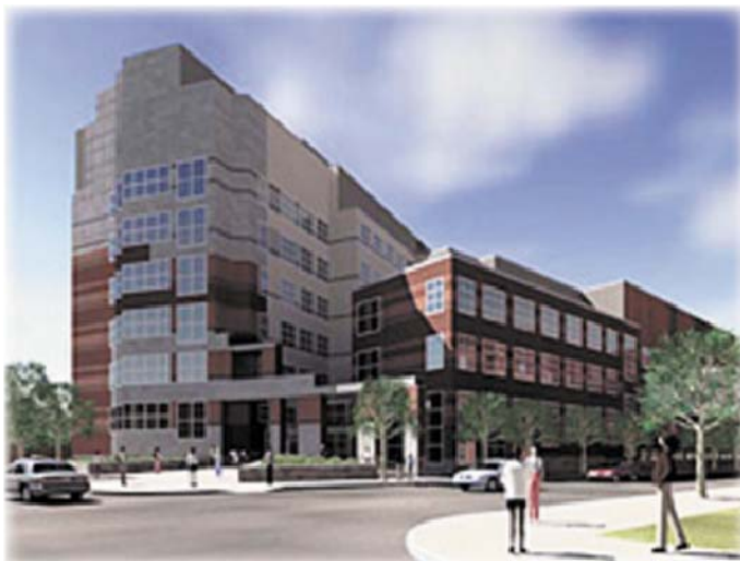
The Anlyan Center