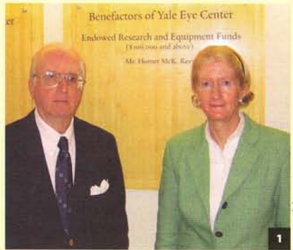
JUN LUN (3)

(CLERF). After 50 years of partnership to prevent blindness, the cumulative total of CLERF grants to Yale tops $3 million, and the foundation has pledged to donate an additional $1 million to support research on macular degeneration and glaucoma, as well as pediatric eye care.